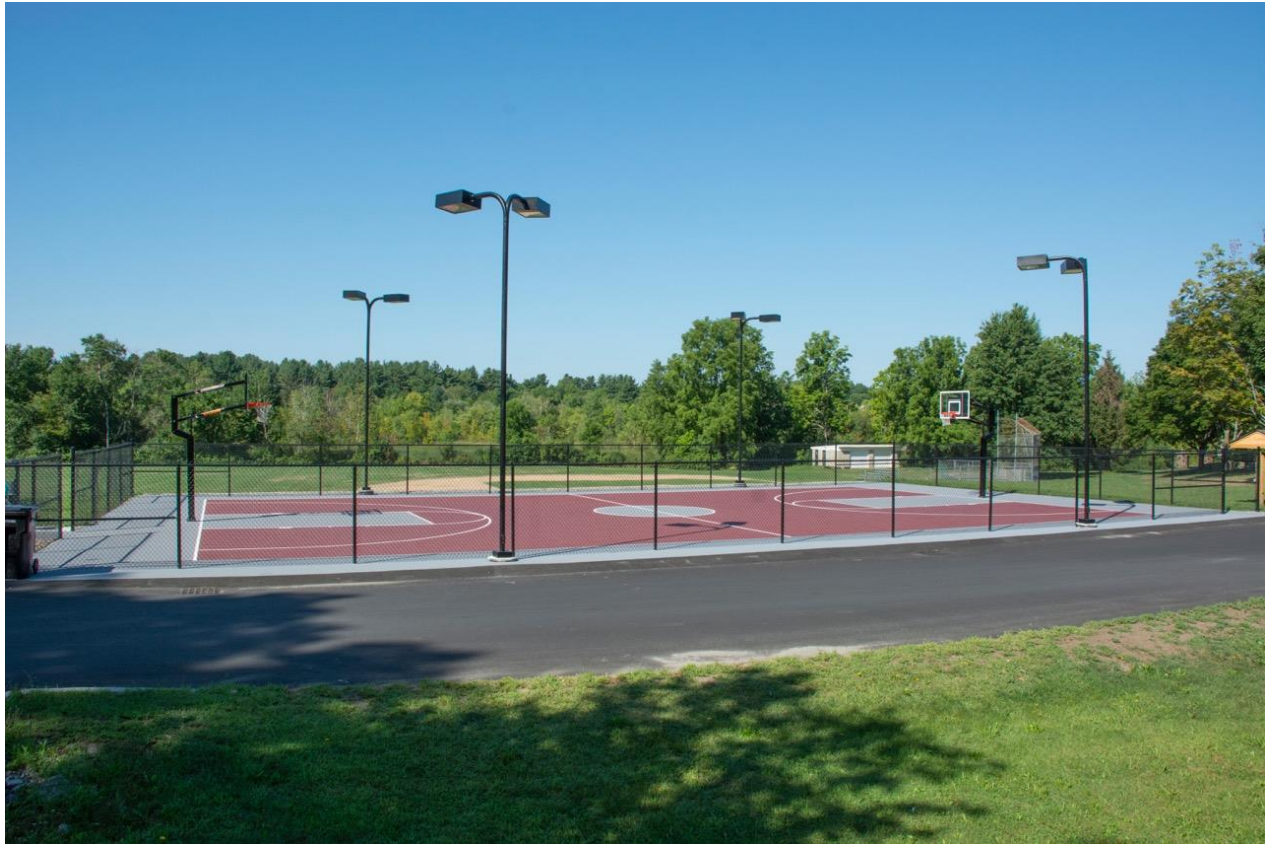
Town Field Basketball Court 2016

Prepared by the Groton Community Preservation Committee