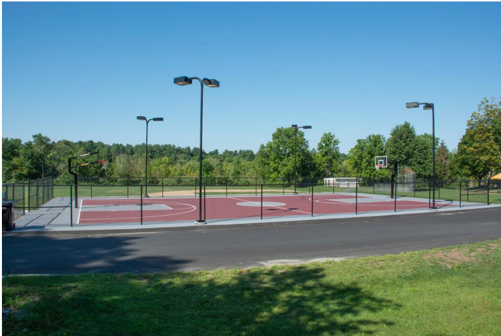
Figure 8: Town Field Basketball Court

Figure 8 ), underwent full-scale restoration. The town field restoration included lights that allow for evening play. The Parks Commission request for $109,000 was approved at the 2016 spring Town Meeting. The DPW provided the majority of labor and materials for the projects.